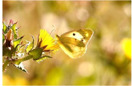
Clouded Yellow 'helice' Vic Savery

Clouded Yellow F Colias croceus helice Tortworth August 12th 1996