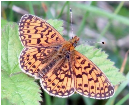
Small Pearl-bordered Fritillary TBOSG

SMALL PEARL-BORDERED FRITILLARY S Boloria selene Inglestone Common July 9th 1967