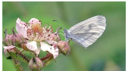
Wood White TBOSG

WOOD WHITE S Leptidea sinapis Hawkesbury Upton June 7th 1982