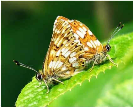
Duke Of Burgundy Fritillary TBOSG

DUKE OF BURGUNDY FRITILLARY S Hamearis lucina Lower Woods 1830