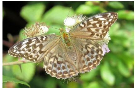
Silver-washed Fritillary 'valesina' TBOSG

Silver-washed Fritillary F Argynnis paphia valesina Lower Woods July 26th 2014