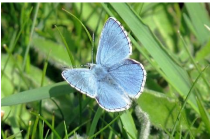
Adonis Blue TBOSG