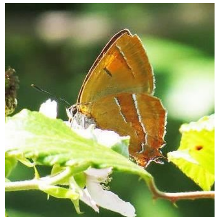
Brown Hairstreak TBOSG

PURPLE HAIRSTREAK S Favonius quercus <1877