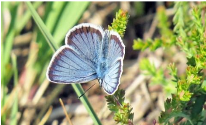
Silver-studded Blue TBOSG