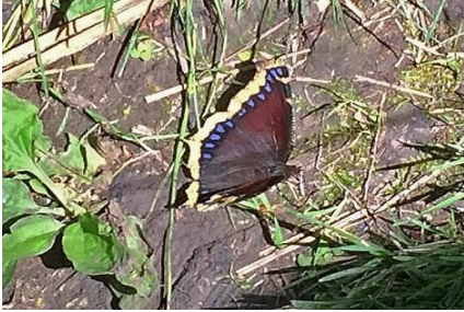
Camberwell Beauty

CAMBERWELL BEAUTY S Nymphalis antiopa Staple Hill August 5th 1875