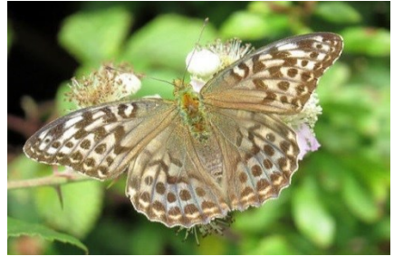
Silver-washed Fritillary 'valesina' TBOSG

Silver-washed Fritillary F Argynnis paphia valesina Lower Woods July 26th 2014