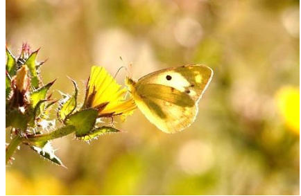
Clouded Yellow 'helice' Vic Savery

Clouded Yellow F Colias croceus helice Tortworth August 12th 1996