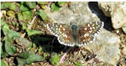
Grizzled Skipper TBOSG